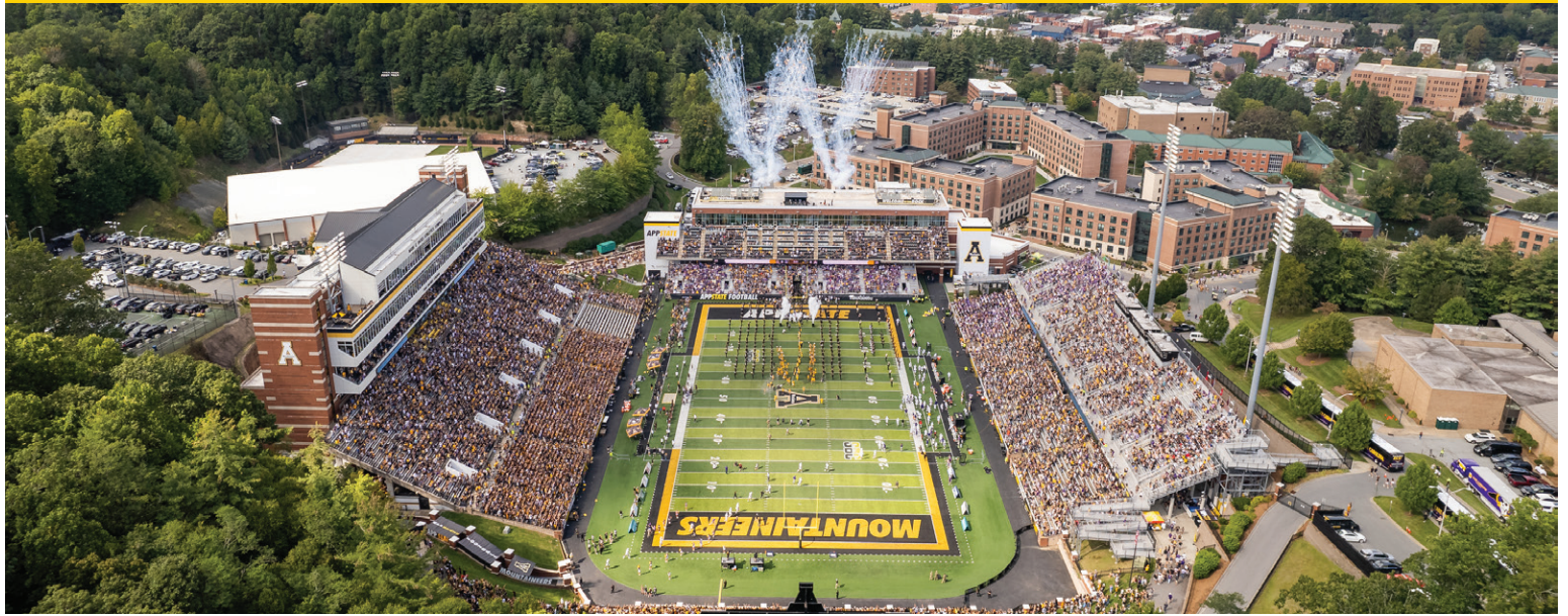
Above: App State's Kidd Brewer Stadium, also known informally as "The Rock," routinely sells out home football games to crowds of more than 30,000. ESPN named the stadium a Top 25 Stadium in America for 2024, citing it as "one of the most beautiful scenes in all of college football."