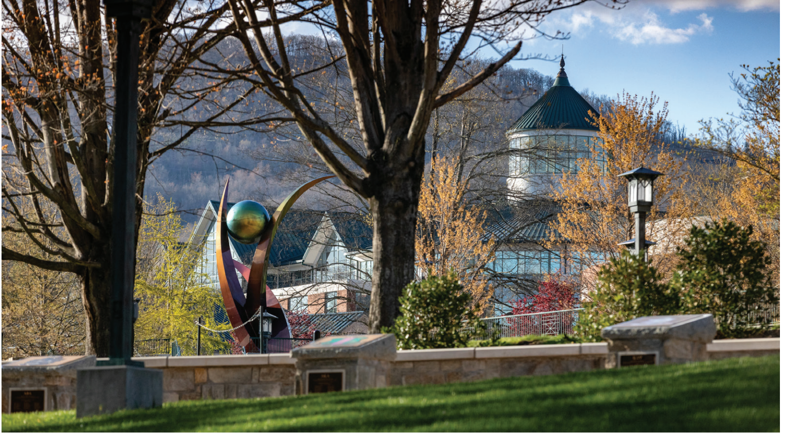
Above: This view of App State’s Boone campus features the National Pan-Hellenic Council Plots and Garden in the foreground, the university’s Aspire Sculpture on Sanford Mall, and the Belk Library and Information Commons in the background.